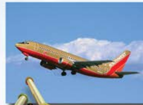
737 Wing Flap Ball Screws