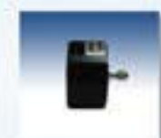
Brush DC Miniature Motor