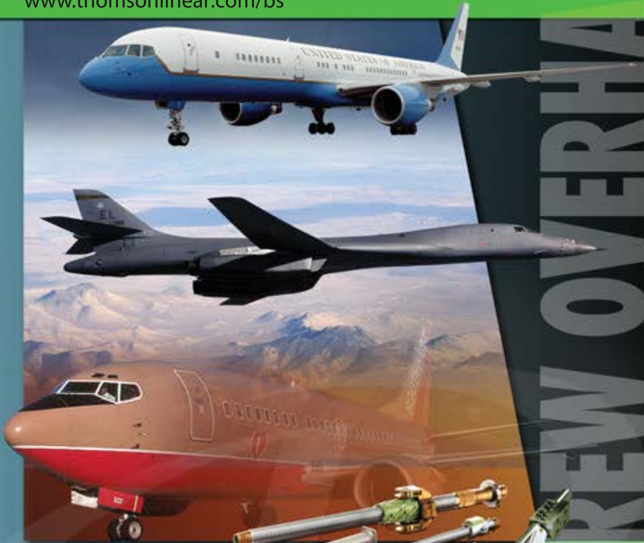
Some images courtesy of Southwest Airlines.