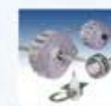
Digital Linear Actuator