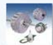
Digital Linear Actuator