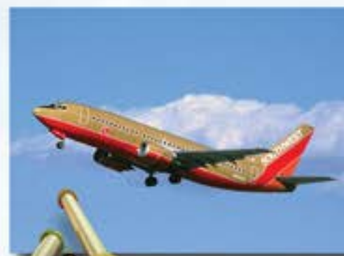
737 Wing Flap Ball Screws