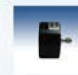
Brush DC Miniature Motor