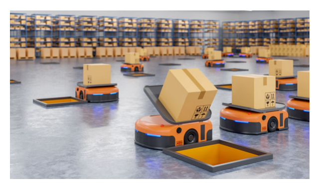
Long-life electric actuators have created a new, affordable solution for automated guided vehicles (AGVs), which can run all day and night and perform frequent linear motion tasks.

A new generation of long-life electric linear actuators has emerged to give designers more flexibility for high-duty-cycle/lower-accuracy motion in applications for which traditional actuators were previously cost-prohibitive or substandard in their duty cycle ratings/abilities. Even better, these long-life, DC-driven actuators are available at a price point that makes high duty cycle affordable for a new range of applications.