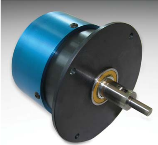
Figure 5 - Thomson Torque Feedback Device (TFD) provides a variable torque output, in proportion to a DC input, for steering and other by-wire applications.

Likewise, smart actuators can be used in agricultural vehicles to optimize the adjustment of harvesting systems on combines. The combine's grain processing chamber takes the threshed grain and cleans it from its chaff by blasting it with air and running it through a sieve. The air flow louver adjustment controls the volume of air flowing through the cleaning system and the louvers must frequently be adjusted to optimize the performance of the cleaning unit for various crop conditions. Too much air flow and you lose grain, too little air flow and the chaff isn't blown out. Normally, the operator must climb down from the cab to make these adjustments which reduces productivity. With electric actuators, this can now be controlled from inside the cab.