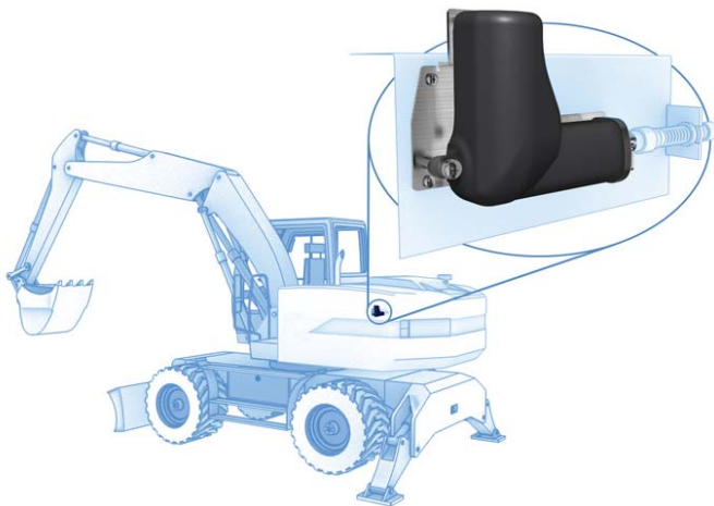
Figure 1 - Throttle actuators allow automatic control of engine speed for reduced noise and emissions, and improved fuel economy.

Original equipment manufacturers (OEMs) of industrial utility and other off-highway vehicles are adding automated or improved manual control of many features and functions in order to improve performance, safety, ergonomics and cost. Frequently these improvements are based in computing technology that must be translated into physical motion in order to provide a benefit to the customer. Traditional hydraulic and pneumatic controls are often unsuitable for computer-driven operation, so there is a trend towards increasing use of electrical drive solutions. Smart electrical actuators with built in position feedback, power systems and bus communications provide a cost-efficient solution that converts control logic into smart motion motions.