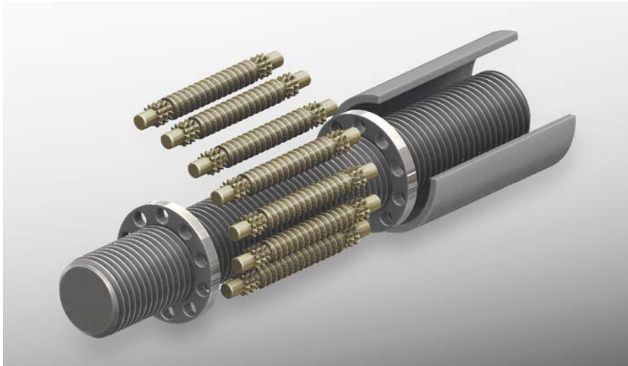
Figure 2: Roller bearing with grooved rolling elements.